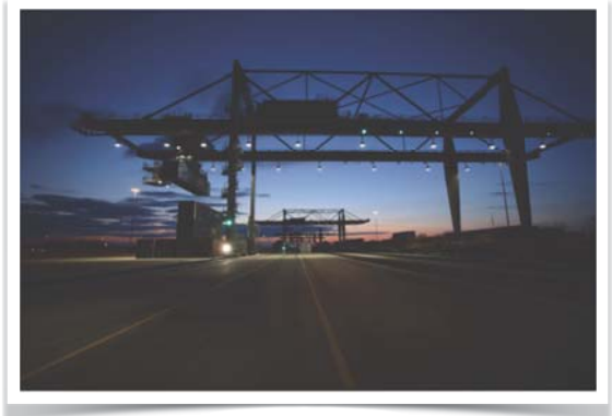
A 302' crane at Northwest Ohio Terminal facility in North Baltimore, a 185-acre world-class freight distribution hub that employs nearly 300 full-time employees.

Each double-stack intermodal train can carry the load of up to 280 trucks, freeing highway capacity for approximately 1,100 cars.